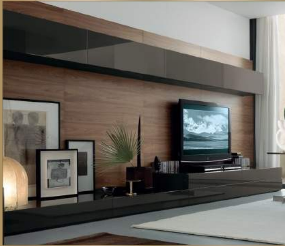
Elegance Space For Tv Lounge's