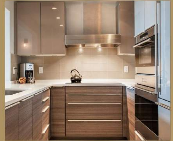
Beautifully Managed Kitchen Cabinets