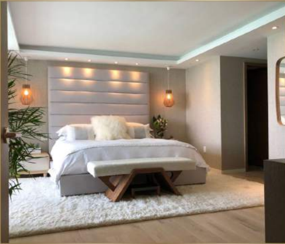
Modern Executive Bedrooms