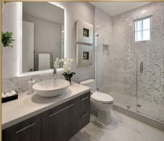
Ultra Finishing Washroom