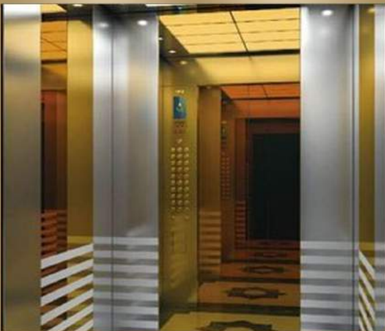
High Speed Golden Elevators