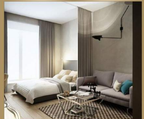
Avail a Luxurious Life Style at Studio Bed